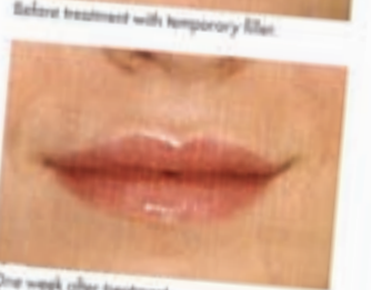
One week after treatment. (This photograph represents one person's experience and there is no guarantee that any other patient will experience similar results).

FOR MORE INFORMATION www.edeninstitute.com.au :: T 02 8814 5800 :: CHATSWOOD • BAULKHAM HILLS