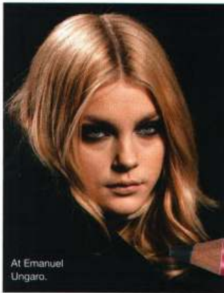
At Emanuel Ungaro.