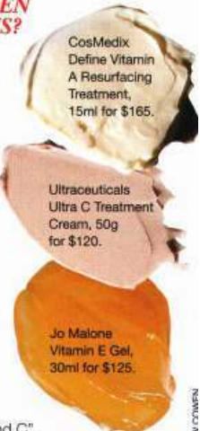
CosMedix Define Vitamin A Resurfacing Treatment, 15ml for $165.

His prescription is simple. While he says many of the mass-market brands are getting close, "there are three which, from the medical point of view, are really good: UltraCeuticals, Environ and CosMedix".