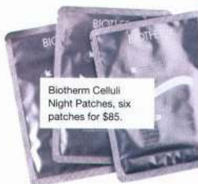
Biotherm Celluli Night Patches, six patches for $85.

Mother always said there's nothing a good night's sleep can't cure, but she probably wasn't thinking of cellulite. Applied overnight, Biotherm's Celluli Night Patches infuse troubled areas with caffeine while the body rests and rejuvenates, giving us hope for a smoother, firmer morning after.