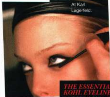
THE ESSENTIAL: KOHL EYELINER Benefit BAD gal eye pencil, $34.