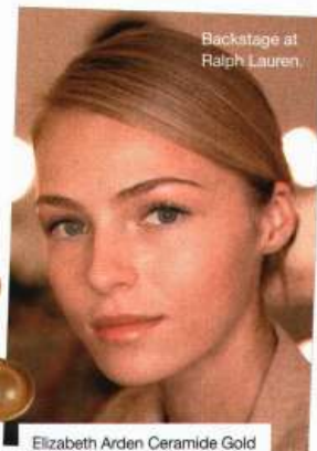
Backstage at Ralph Lauren.