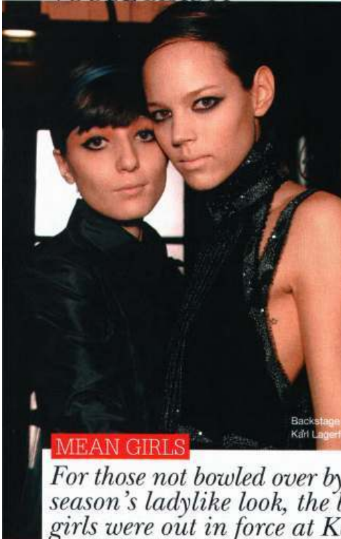
Backstage at Karl Lagerfeld.