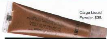
Cargo Liquid Powder, $39.